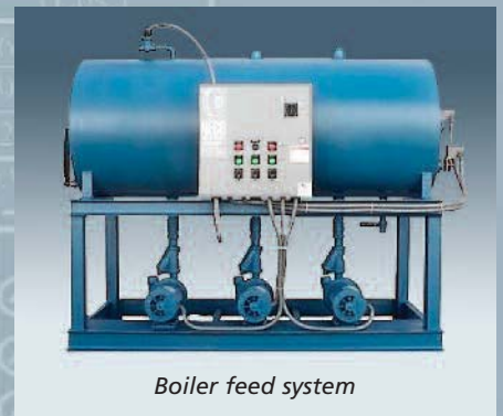
Boiler feed system