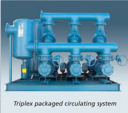
Triplex packaged circulating system