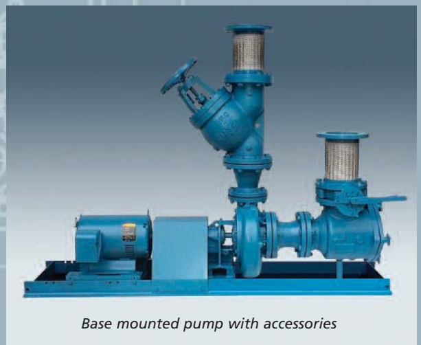
Base mounted pump with accessories