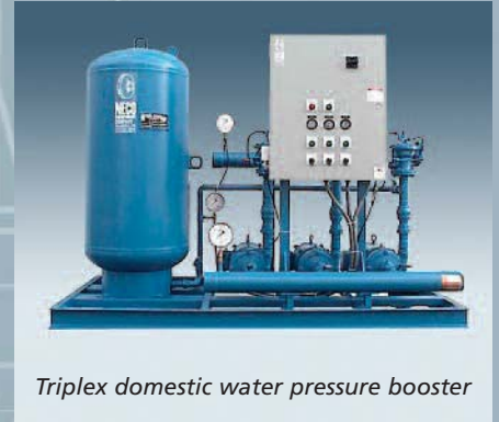
Triplex domestic water pressure booster